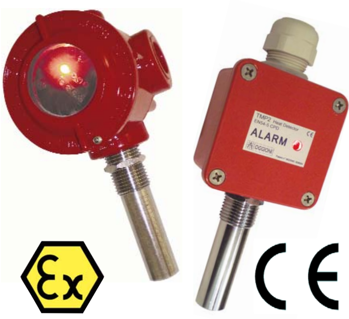
CESI 03 ATEX 042