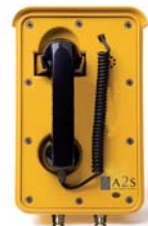
INDUPHONE without keypad, without case cover