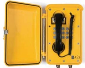
INDUPHONE with keypad & case cover