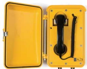
INDUPHONE with case cover, without keypad